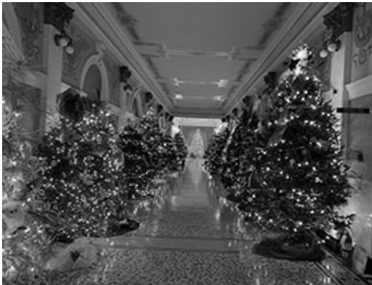
Trees at the state capitol