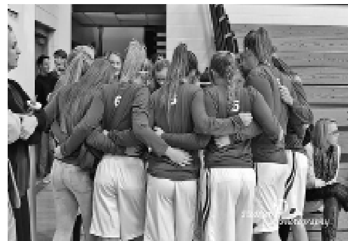
Lady Goves Basketball huddles before their game