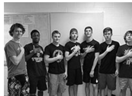
One of the senior intramural basketball teams