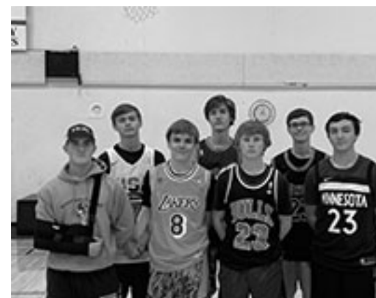
One of the Junior intramural basketball team