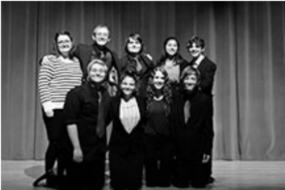
State oral interp competitors